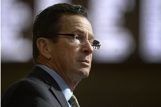
Connecticut Gov. Dannel Malloy.